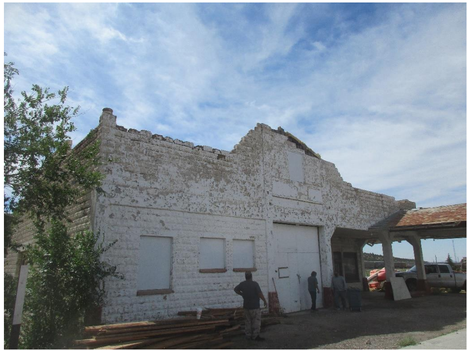
Hualapai Planning Department