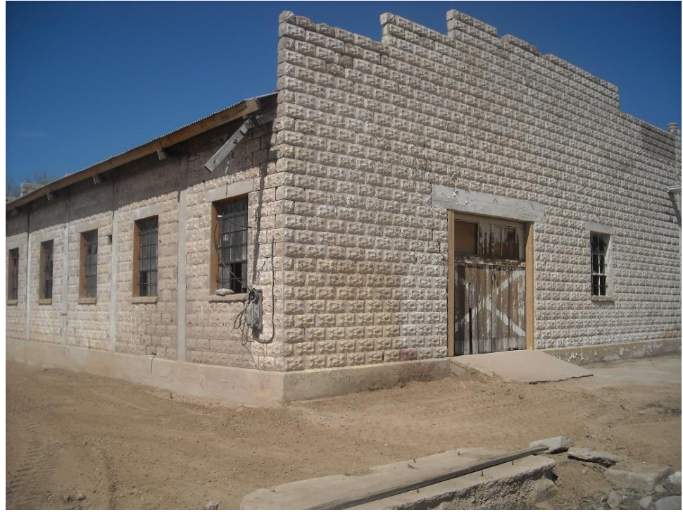
Hualapai Planning Department