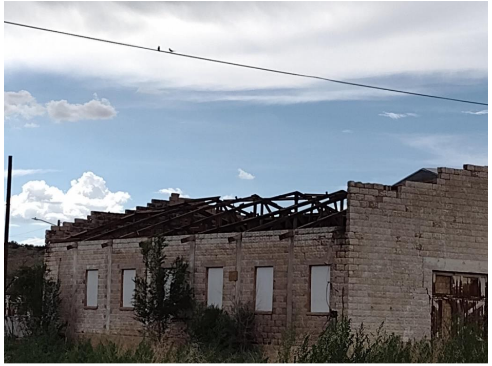
Hualapai Planning Department