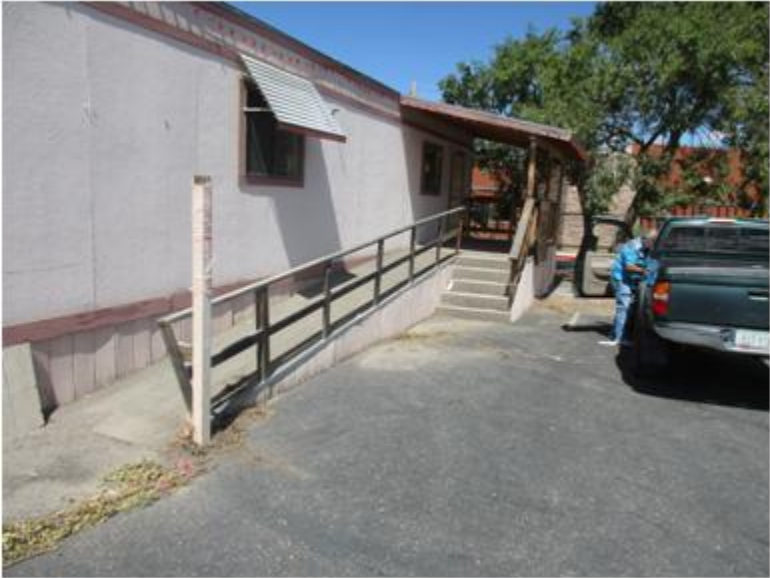
Westerly side of the building