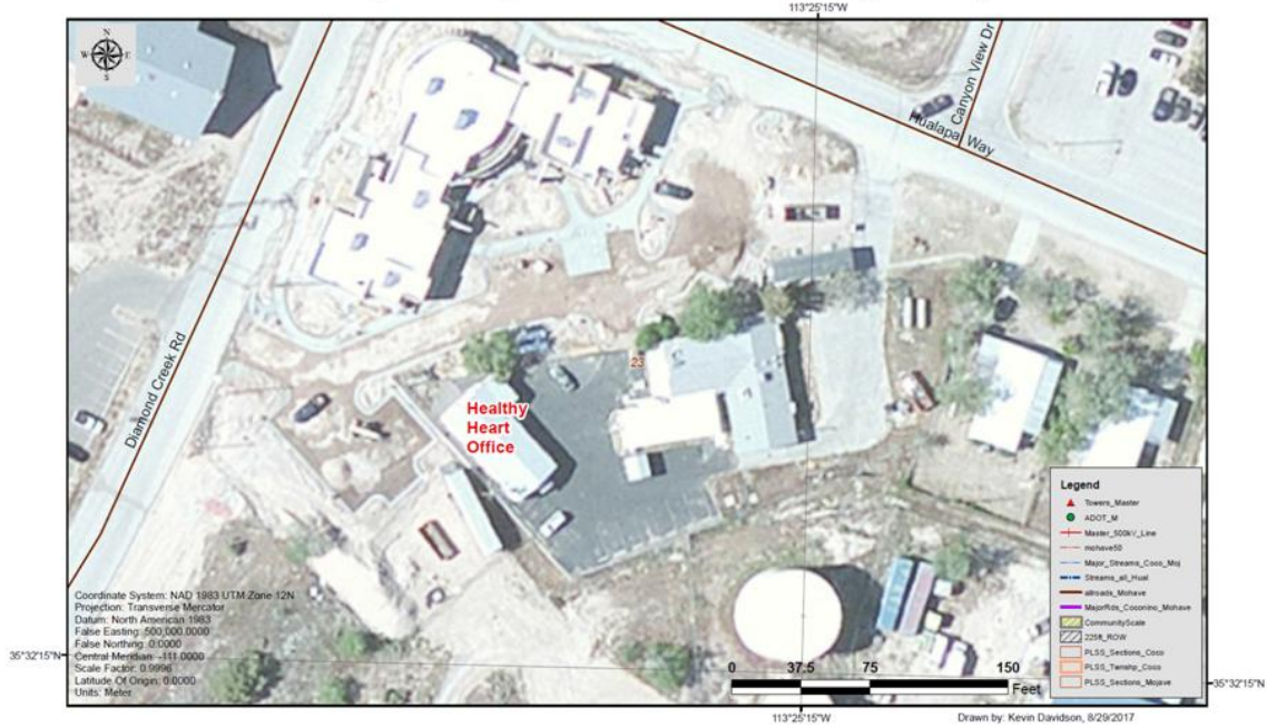
Aerial Map of Healthy Heart Office and Surrounding Buildings