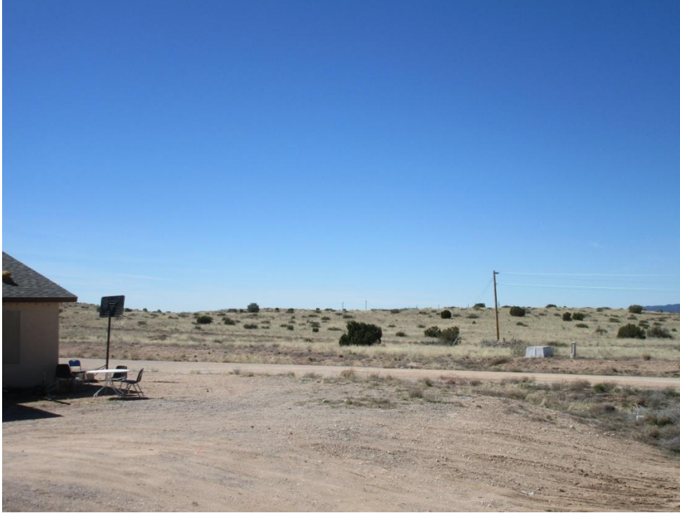
Looking west across Box Canyon Road from adjacent Lot 16.