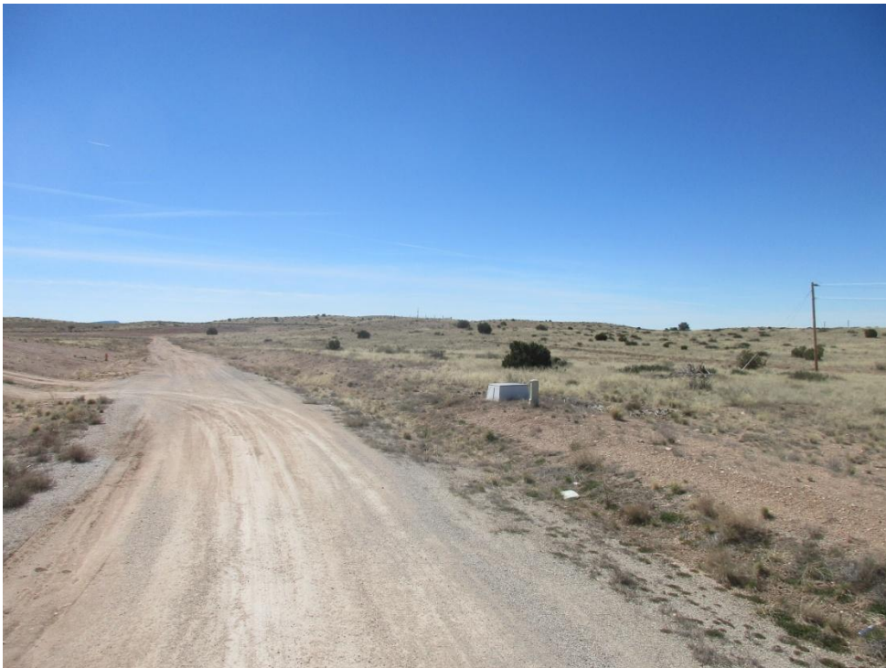
Looking south along Box Canyon Road